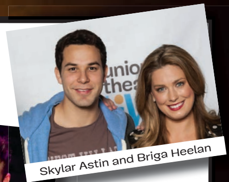
Skylar Astin and Briga Heelan